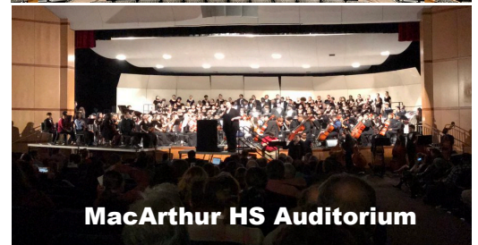
MacArthur HS Auditorium