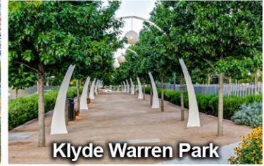
Klyde Warren Park