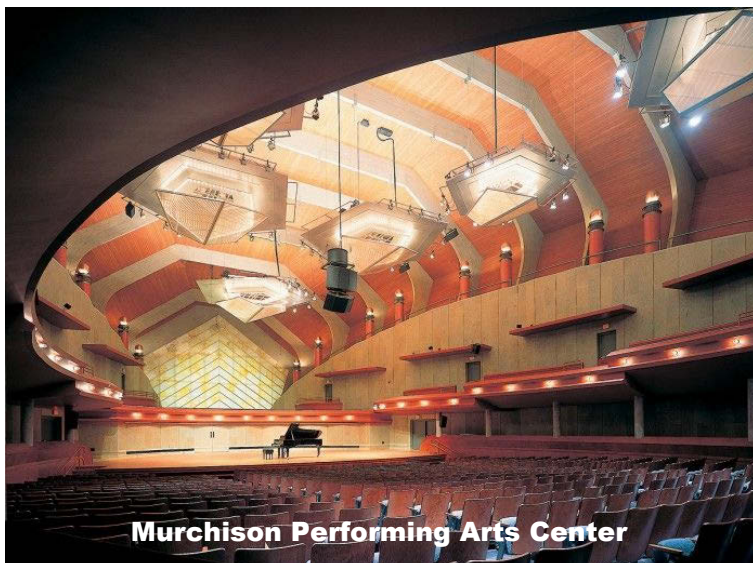
Murchison Performing Arts Center