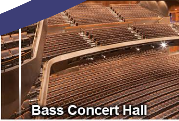
Bass Concert Hall