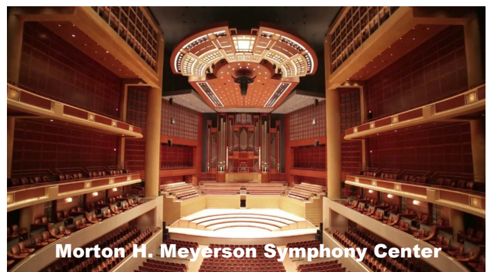
Morton H. Meyerson Symphony Center