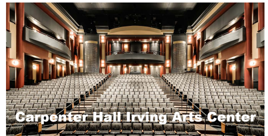
Carpenter Hall Irving Arts Center