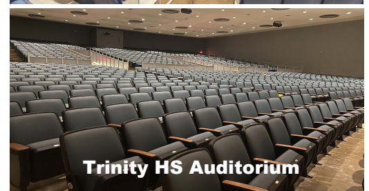
Trinity HS Auditorium