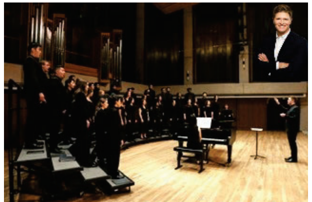
Guest Choir Performance Preceding Awards Ceremony