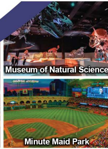
Museum of Natural Science