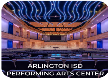
ARLINGTON ISD PERFORMING ARTS CENTER