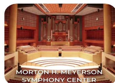
MORTON H. MEYERSON SYMPHONY CENTER