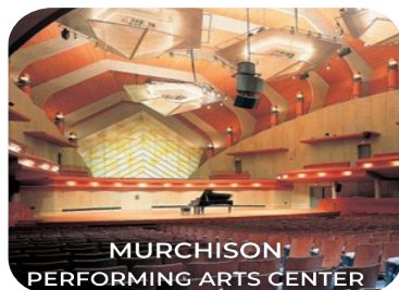
MURCHISON PERFORMING ARTS CENTER

American Classic Music Festivals really has the best interest and the best experience for all groups! High quality service, staff is very helpful on site and a great adjudication! My students had a fantastic experience performing at the UNT Murchison Performing Arts Center! Will definitely be back next year!