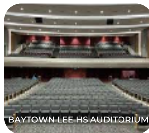
BAYTOWN LEE HS AUDITORIUM