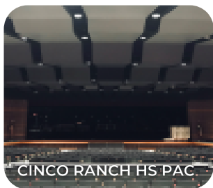
CINCO RANCH HS PAC

The planning was AMAZING!!! Our restaurant had everything ready and set to go when we arrived (30 min early) and it was very smooth and professional!! THE HOTEL WAS FANTASTIC. It was a great trip!!!! The kids had a wonderful time and made some life-long memories with their friends. It was a positive experience on all fronts.