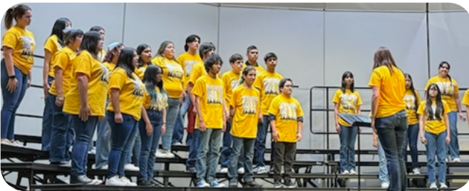
MIGEL VILAS BRADLEY MIDDLE SCHOOL ORCHESTRA SAN ANTONIO, TX

The staff at American Classic makes all of our experiences memorable! I will continue to sing the praises of the American Classic staff. You are top-notch!