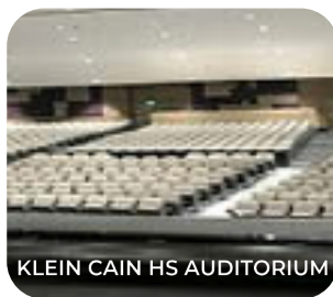
KLEIN CAIN HS AUDITORIUM