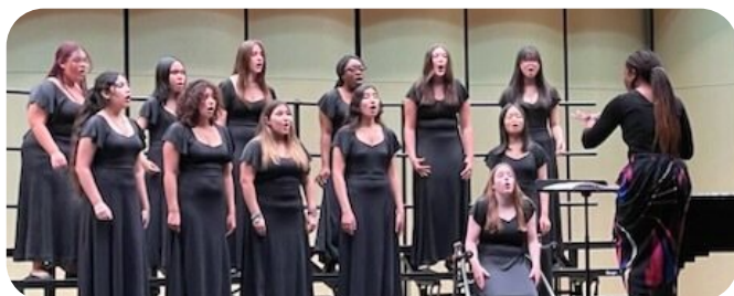
MIGEL VILAS BRADLEY MIDDLE SCHOOL ORCHESTRA SAN ANTONIO, TX

The staff at American Classic makes all of our experiences memorable! I will continue to sing the praises of the American Classic staff. You are top-notch!