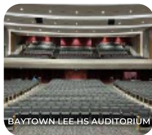
BAYTOWN LEE HS AUDITORIUM