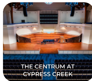
THE CENTRUM AT CYPRESS CREEK