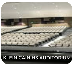
KLEIN CAIN HS AUDITORIUM