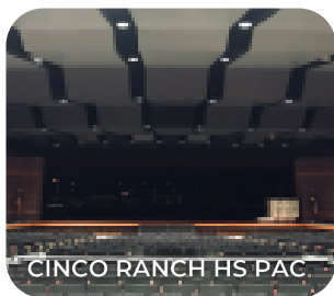
CINCO RANCH HS PAC

The planning was AMAZING!!! Our restaurant had everything ready and set to go when we arrived (30 min early) and it was very smooth and professional!! THE HOTEL WAS FANTASTIC. It was a great trip!!!! The kids had a wonderful time and made some life-long memories with their friends. It was a positive experience on all fronts.