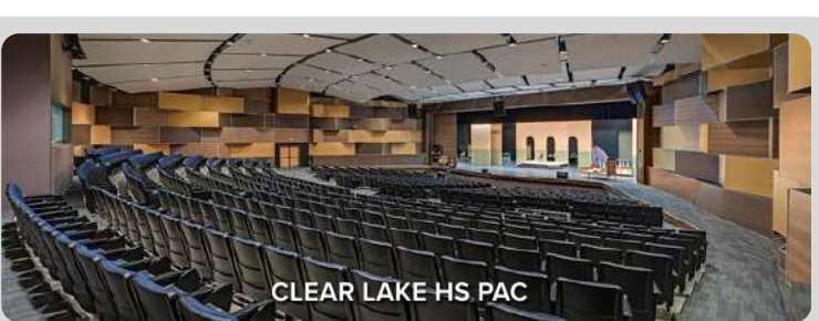
APRIL 24 & 25