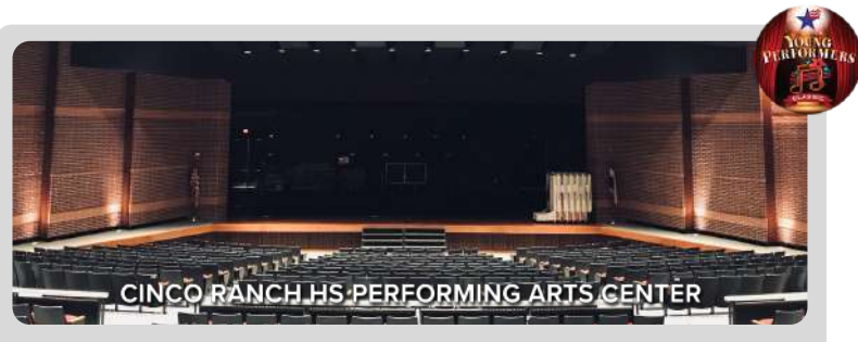
MAY 8 & 9