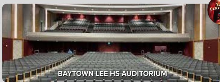
BAYTOWN LEE HS AUDITORIUM