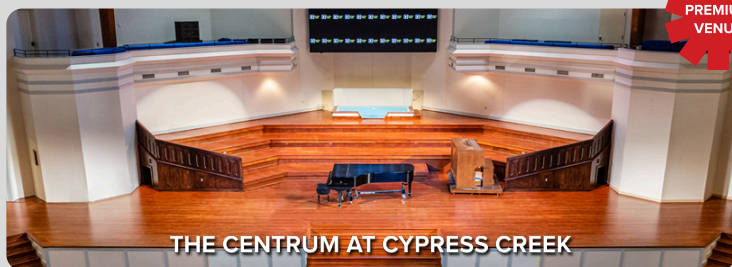
THE CENTRUM AT CYPRESS CREEK

Ready for Takeoff? Perform in a great venue, then blast off for terrific fun in the Houston/Galveston Bay Area!