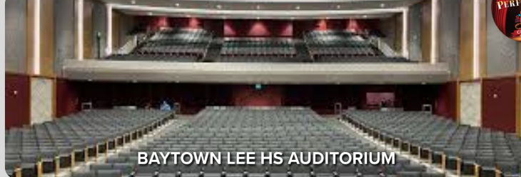
BAYTOWN LEE HS AUDITORIUM