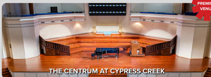
THE CENTRUM AT CYPRESS CREEK

Ready for Takeoff? Perform in a great venue, then blast off for terrific fun in the Houston/Galveston Bay Area!