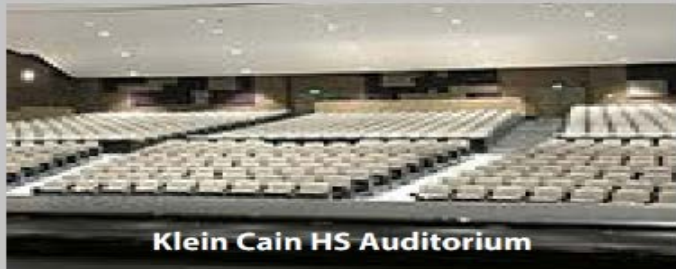
Klein Cain HS Auditorium