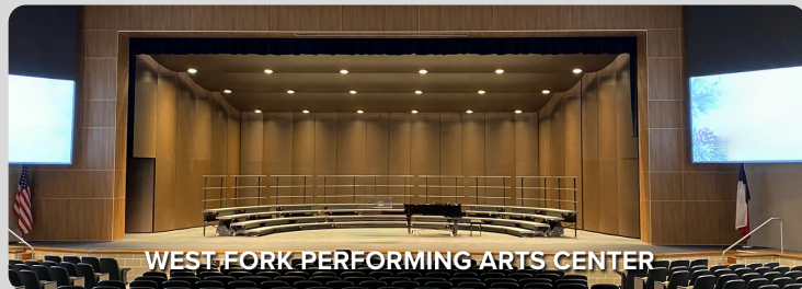
WEST FORK PERFORMING ARTS CENTER