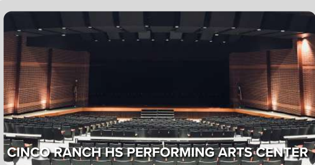
CINCO RANCH HS PERFORMING ARTS CENTER