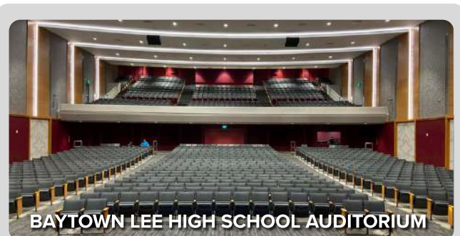
BAYTOWN LEE HIGH SCHOOL AUDITORIUM