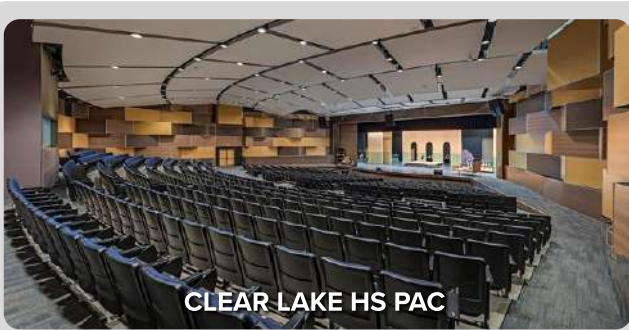
CLEAR LAKE HS PAC

Ready for Takeoff? Perform in a great venue, then blast off for terrific fun in the Houston/Galveston Bay Area!